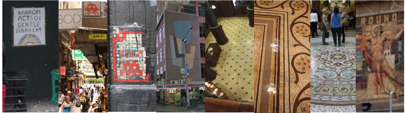
Random Acts c1 Reichardt/Griffiths Space Invaders in 2 laneways c2&3 Invader Beer Glasses c4 Richard Beck Rendezvous c5 Unknown 333 Collins c6 Imported Block Arcade c7 Imported News'House c8 Napier Waller