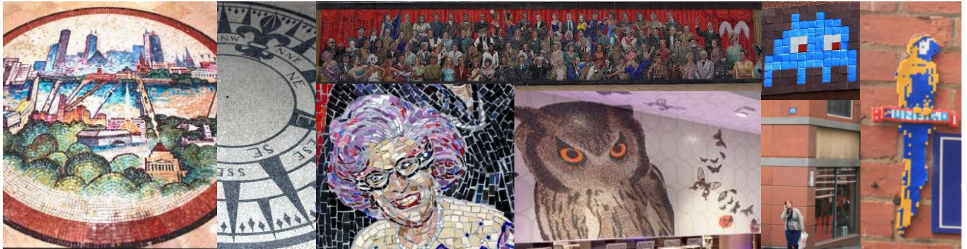
Marvellous Melbourne d1 MMS D.Jack & J.Attard Compass Rose d2 Harbour Light Guild 100 Entertainers d3 MMS Melbourne Central Dining Hall d4 Uncarved Block NSW Space Invader d5 Invader Parrot d6 Unfigo